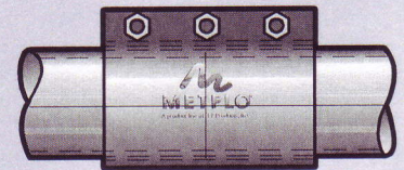
METFLO® Compression Coupling